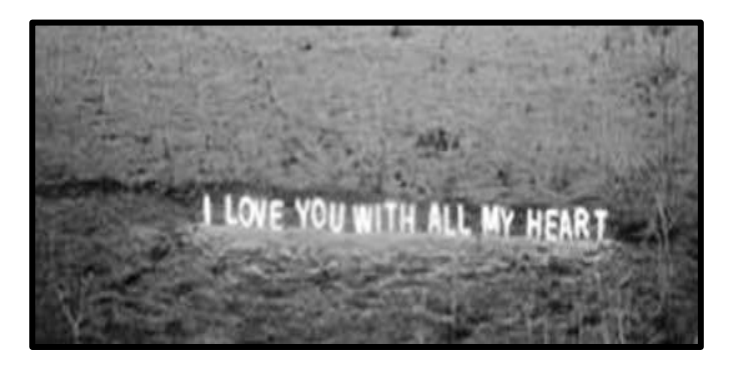
Rituals of Love